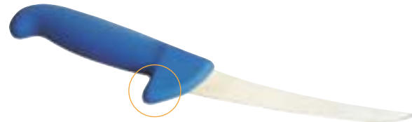
Alternative knife handle design – boning knife