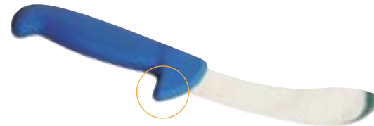
Alternative knife handle design – skinning knife