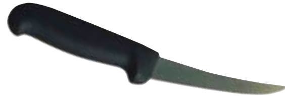
Traditional boning knife

While there are knives with guards designed to reduce run throughs, they need further evaluation. Further research would be helpful to evaluate recent knife releases from Germany. Other knives also offer features that may reduce injuries.